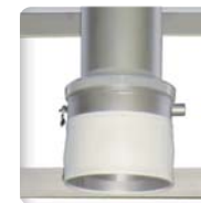
Double envelope filling head allows big bag degassing in conditioning procedure