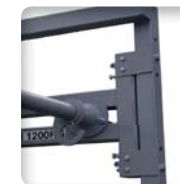
Hooking forks with adjustable height offer a maximum flexibility